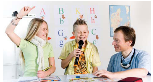
Student using optional hand held microphone.

Ask our trained and helpful staff to advise you on the model of Frontraw™ Pro, Tempo or To Go to suit your needs.