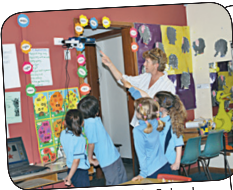
Gilgandra Public School