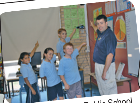
Excited Gilgandra Public School with FrontRow™ Pro Digital system.