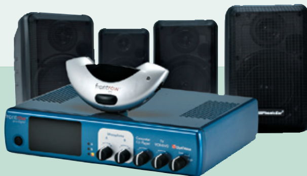
Actual system has 4 speakers, infrared sensors and lavalier microphone.

Email: sales@printacall.com.au | Web: www.printacall.com.au